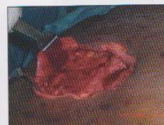
After two dressing changes