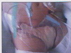
During NPWT - 12 days from admission