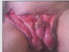
At the end of NPWT (last dressing) 22 days from admission