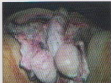
The wound after the last debridement (before NPWT) 10 days from admission