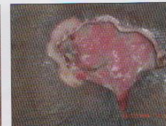
Last dressing change